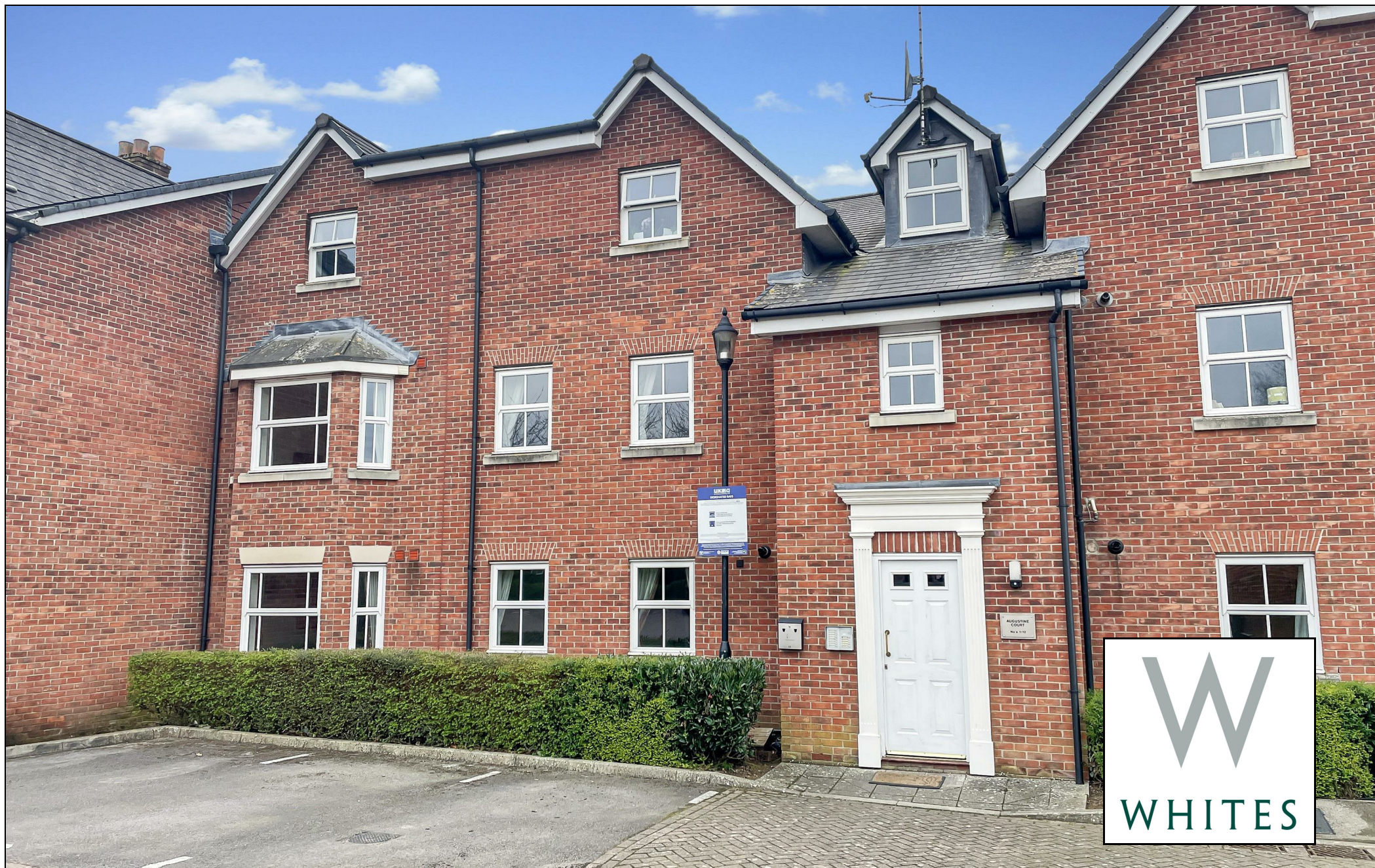
Flat 8 Augustine Court, Spire View, Salisbury, Wilts, SP2 7GA